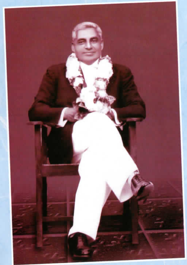
Marshal A. Nesamony, M.A., B.L., Ex.M.P.