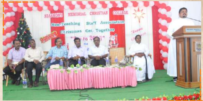
Christmas Celebration - Non-Teaching Staff