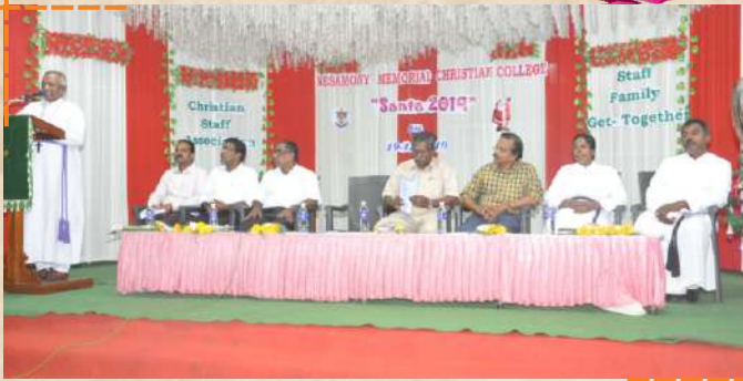
Christmas Celebration - Teaching Staff